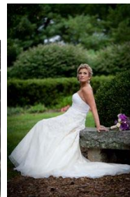
Wedding Planning by Go Get It Events