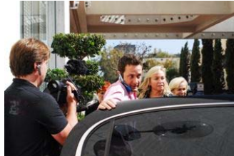
"The Escapade" Romantic Adventures