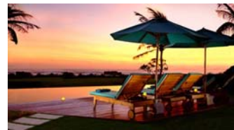
Travel & Honeymoon Planning

Thank you dear readers, clients and friends. We hope you enjoyed our story and newsletter. The next time you have a unique, creative, or special event to celebrate or plan, please contact us.