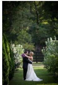
Click here for more photos